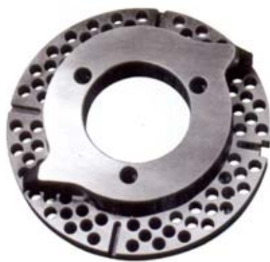
Headstock & Shearplate from a Haigh Macerator