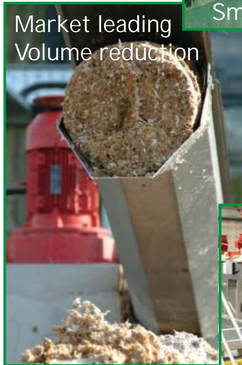
Market leading Volume reduction