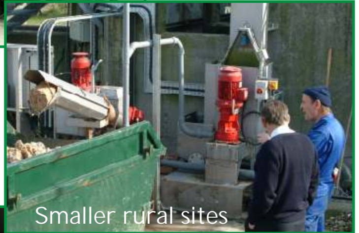
Smaller rural sites