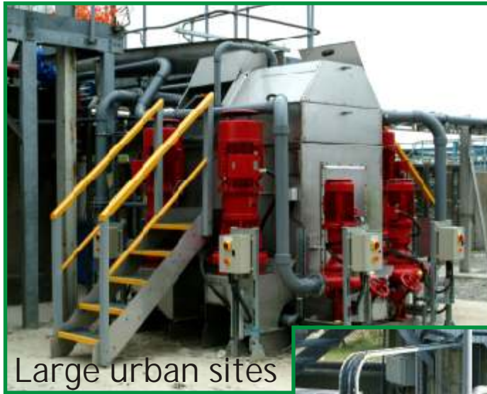
Large urban sites