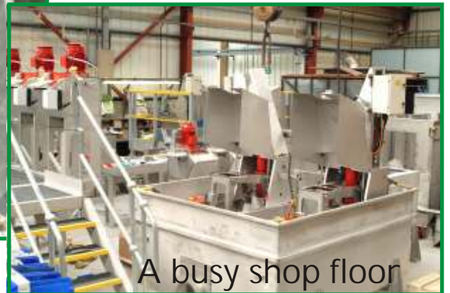
A busy shop floor

Haigh Engineering based in Ross-on-Wye England, have over forty years experience of designing manufacturing and installing sewage conditioning equipment. With installations for all the major water companies in the UK, Haigh are well placed to recommend and supply screening, screenings handling, and dewatering equipment around the world.